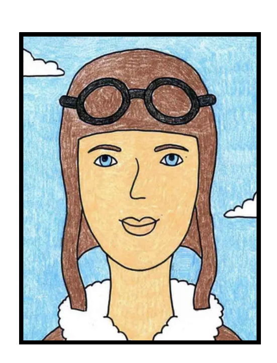
Draw Amelia <u>Tutorial</u> More <u>Free Biographies</u>